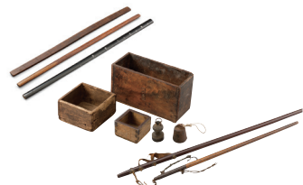
Weights and Measures