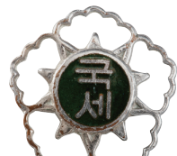
개청 기념 국세 뺏지

[Future of the NTS] section introduces NTS' vision for the better future of Korea.