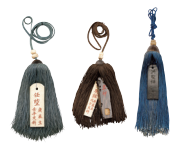
Hopae (resident's identification token)