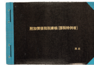
부가가치세 신고 대장